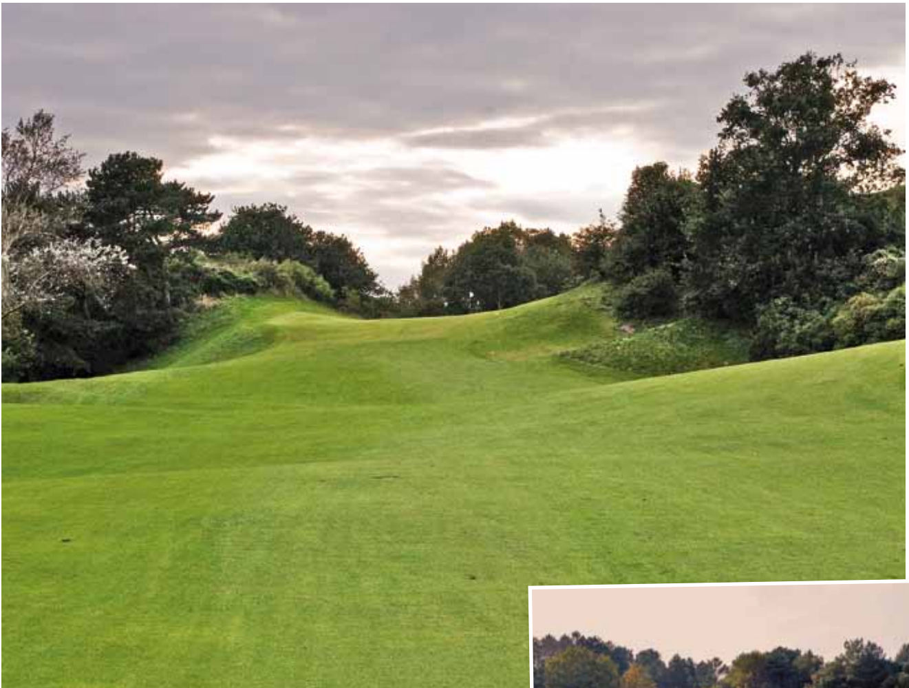
The fourteenth has a glorious greensite. Inset: the renovated sixteenth green complex