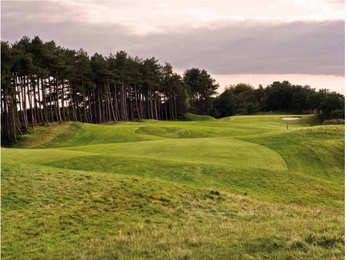
It's hard to imagine more perfect golfing terrain than the land on which Royal Hague's tenth hole sits