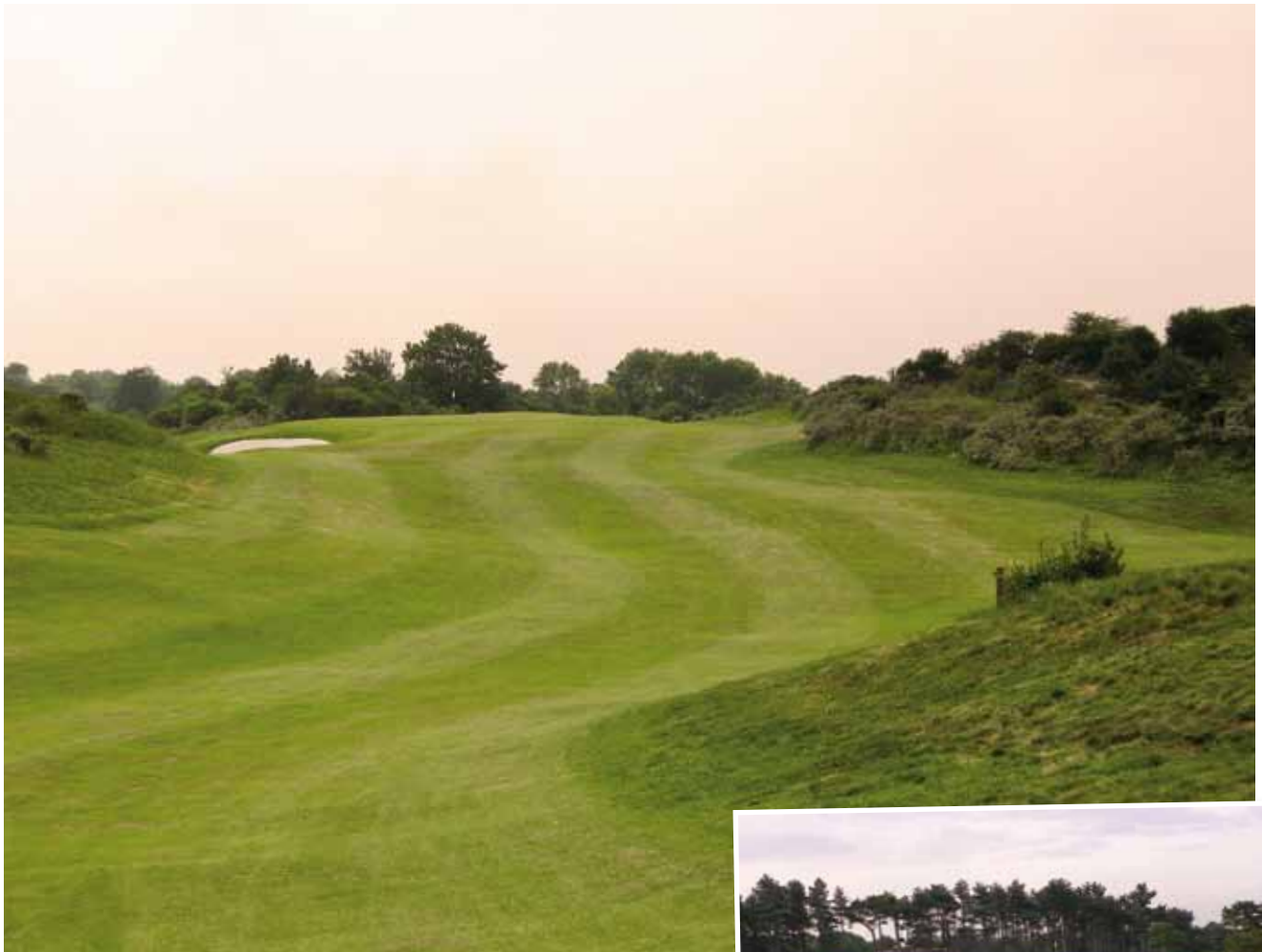
The sixth is a brutal long par four. Inset: the ninth green